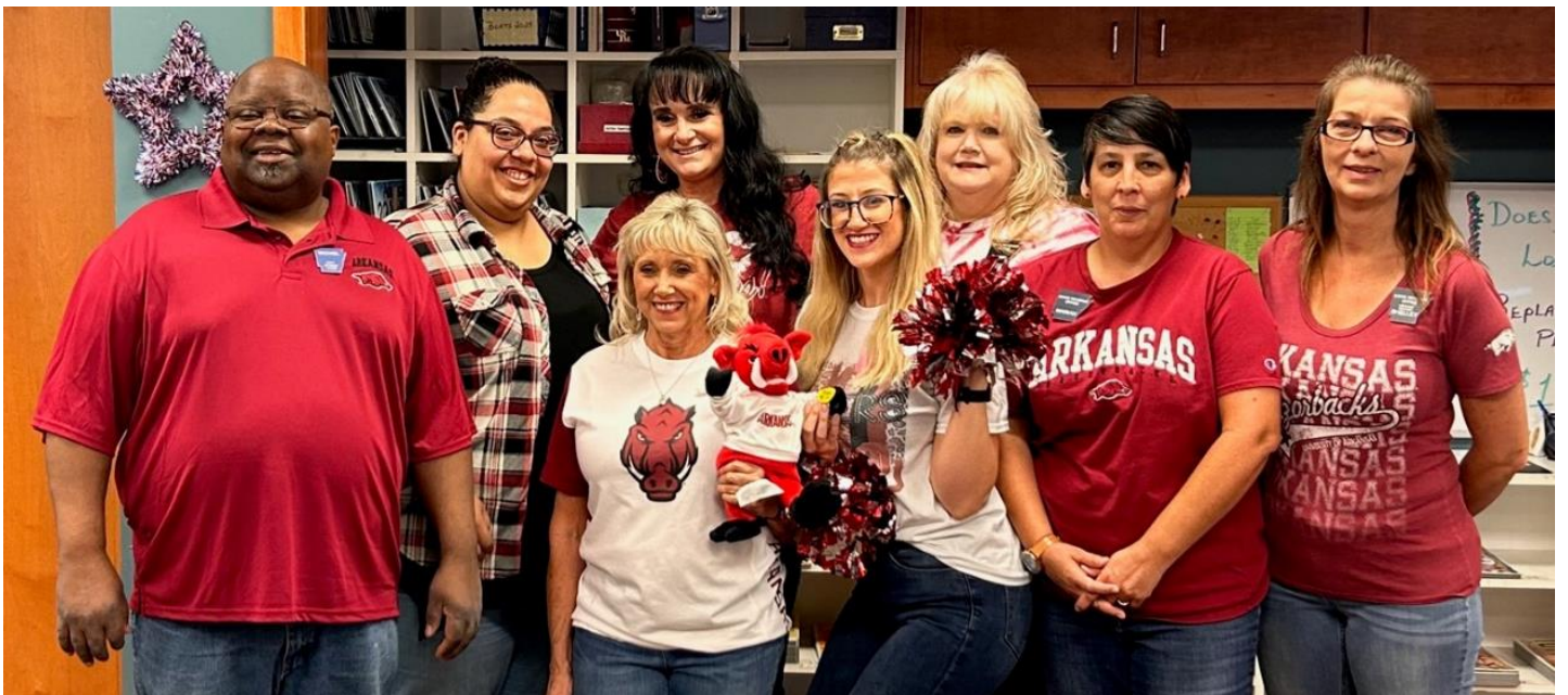
Ft. Smith East Team