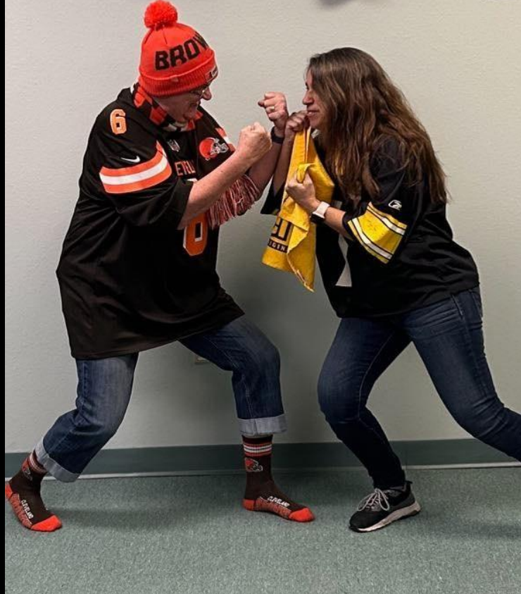
Hot Springs Team