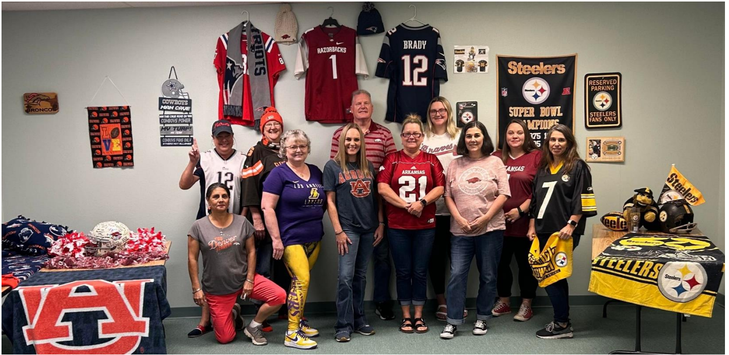
Hot Springs Team