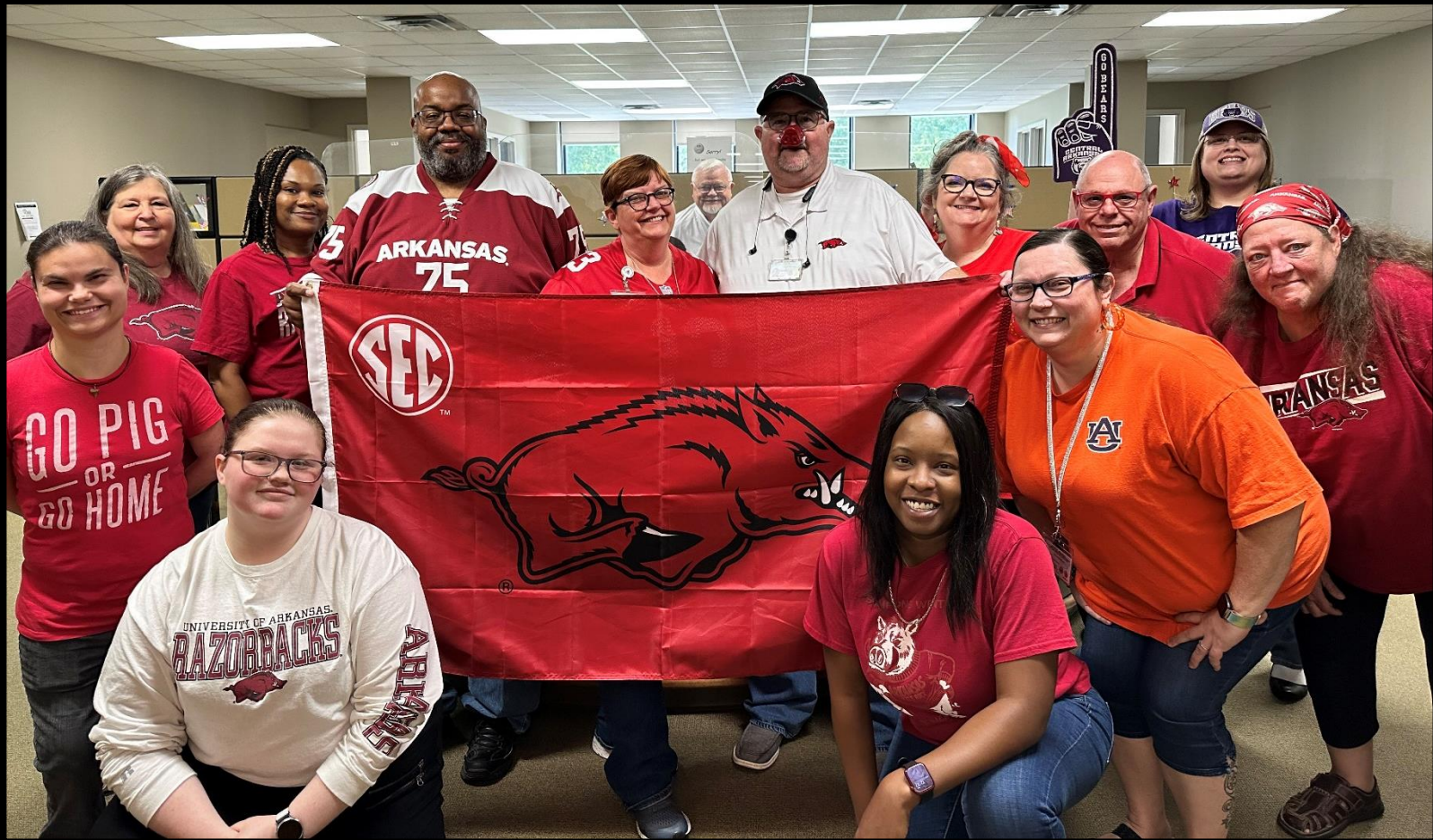
Little Rock Team