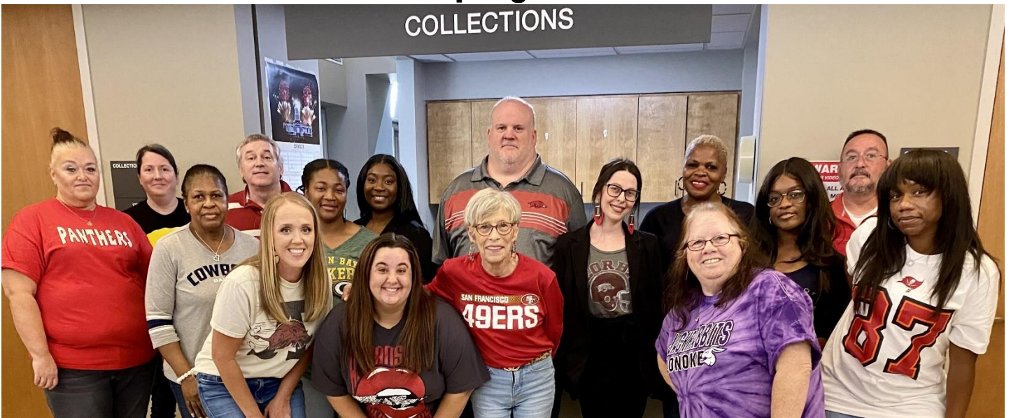
Little Rock Team