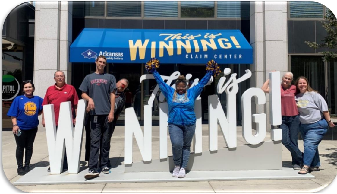
Little Rock Team